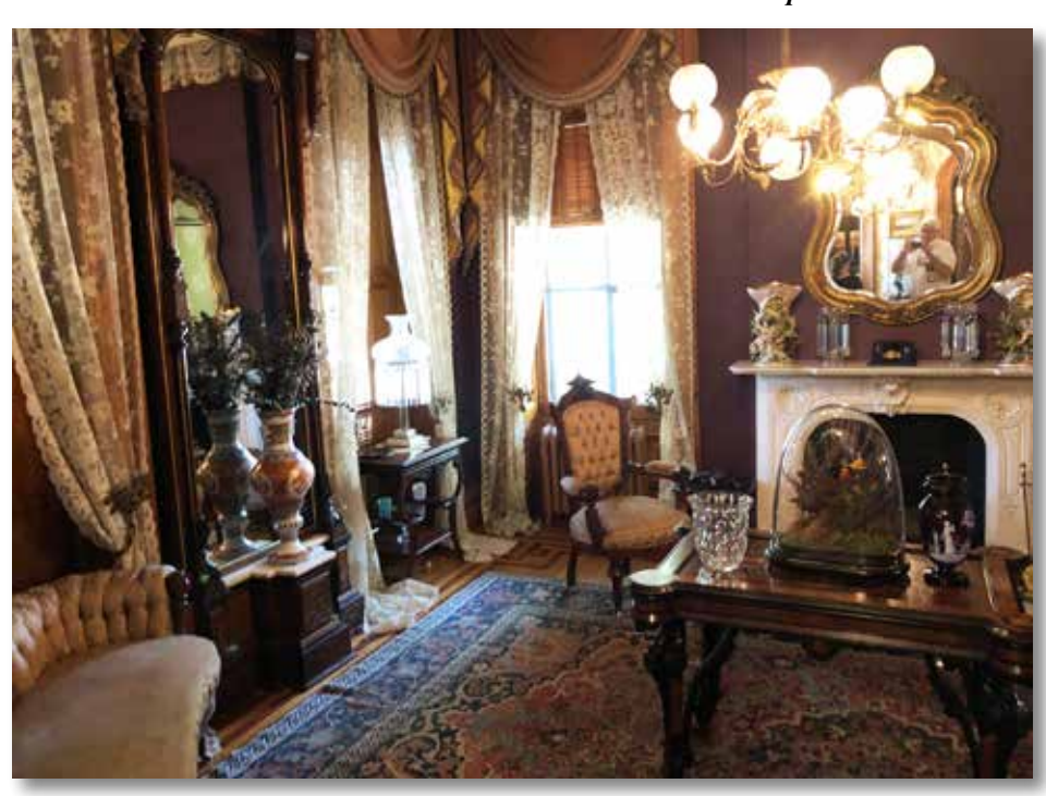
This Tour #9 will not be repeated.

the historic Carnegie Library building. Don't get it confused with the Durham Museum located in Union Station. The President Lincoln collection on display includes artifacts from his rail car and his funeral. In this museum you will travel through 150 years of American railroad history, allowing you to walk through three passenger cars from the 1950s, be in awe of over 300 pieces of Union Pacific silver and fine china, and learn about Hollywood stars traveling by luxury passenger trains before the airplanes arrived on the scene. The entire first floor covers the building of the Transcontinental Railroad, and one of the original Golden Spikes is on display.